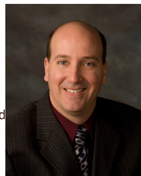
Founder, President & CEO of Skibo, Corporation

"Skibo, Corporation was founded on the principal of providing a consultative approach to a problem, excellent customer service, and reasonable pricing in proportion to the solution required."